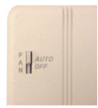
Figure 5: AUTO position on zone sensor for unit ventilator

The AUTO position allows the unit to operate at the default fan speeds (cooling and heating may have different default fan speeds).