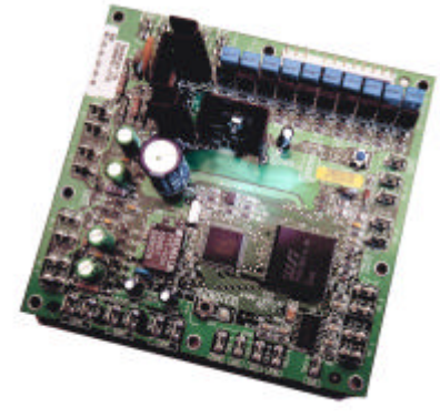
Figure 3: Tracer ZN.520 Unit Controller

The unit controller is designed to provide improved comfort with a minimal amount of energy consumption through the use of custom proportional integral derivative (PID) control algorithms. Based on the equipment type, the controller is factory installed and commissioned, resulting in a highly integrated product. Factory installation and commissioning helps to ensure the highest level of quality and customer satisfaction.