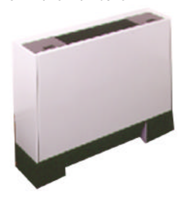
Figure 2: UnitTrane fan-coil